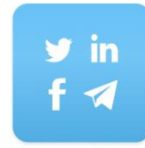
Social Network Ad