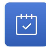
Crypto Event Listing