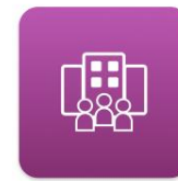
Blockchain Company Listing