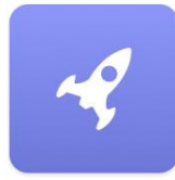
IEO Rocket Listing